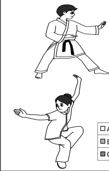
Martial Arts Participation in Hong Kong