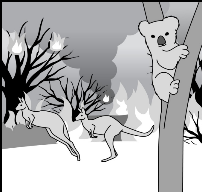
Bushfires – loss of animals and habitat